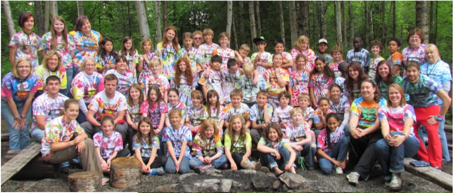
Clockwise from top: Campers & staff at Faith Adventure camp; Team building at MAD camp; Around the Campfire at Middle School camp; Adventure Canoe campers embarking on their journey through the Swanson River canoe system; Commemorative mugs displayed at Founders Day .