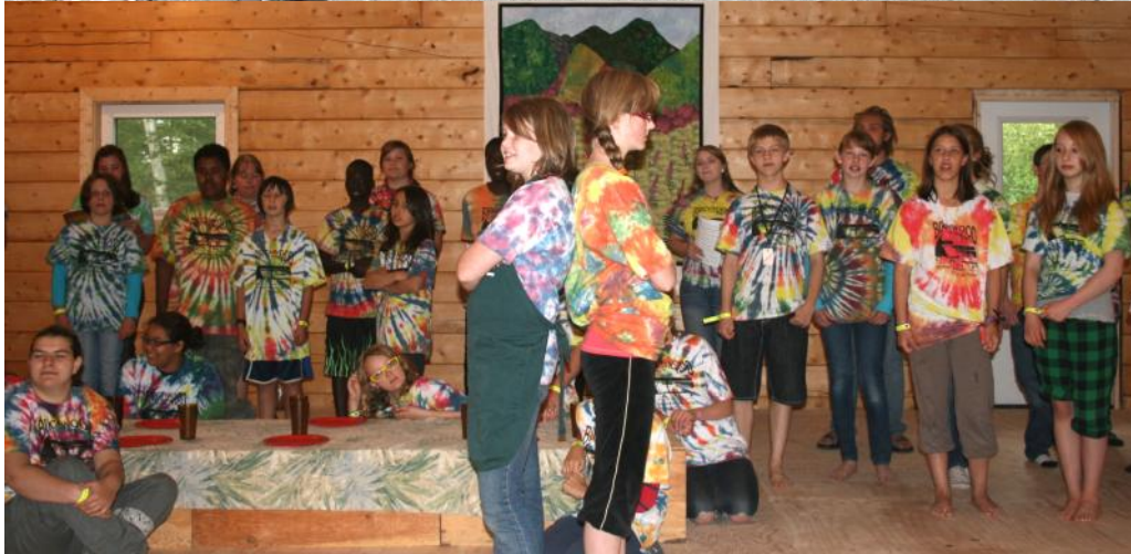
Clockwise from top left: Runners at our Founders Day 5k on May 14; High School campers working on a PET seat; Gazing at beautiful Psalm lake; Music and Drama (MAD) campers performing at Anchor Park UMC; MAD campers rehearsing in Fireweed Hall; Middle and High School camps with a completed PET.